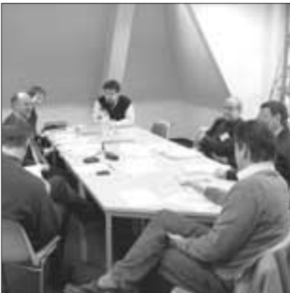
First official meeting of the Jenerálka a.s. Board in March 2006

In recent years we have been marketing our accommodation with the brand name "Hotel Jenerálka" and with our own web site www.hotel-jeneralka.cz . The more people have learned of our beautiful oasis hotel in the delightful Šárka Valley, near to the historic city and midway between downtown and the airport, the more people have chosen to stay here.