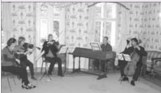
Live classical music in the Chateau's salon

For a few exciting hours on 22 July 2008 the IBTS courtyard was filled with Baptists wandering through the restored neo-renaissance garden, listening to a classical musical ensemble playing in the salon of the chateau, or taking an informative tour of the expansive library.