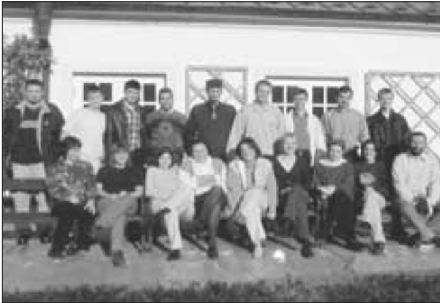
First Certificate in Applied Theology class: 2000 - 2001