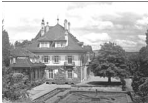
The Sunken gardens of the Chateau at the Rüschlikon seminary: 1949