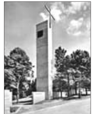
Rüschlikon bell tower