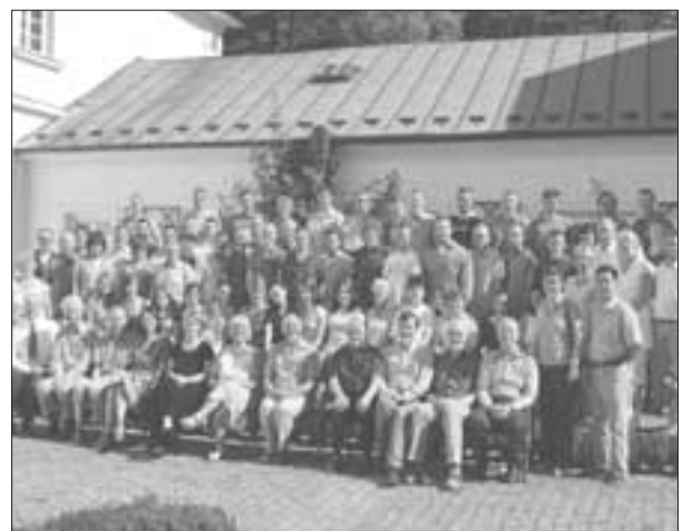
2009 IBTS community