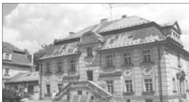
Prague's site for IBTS before extensive renovations: 1996