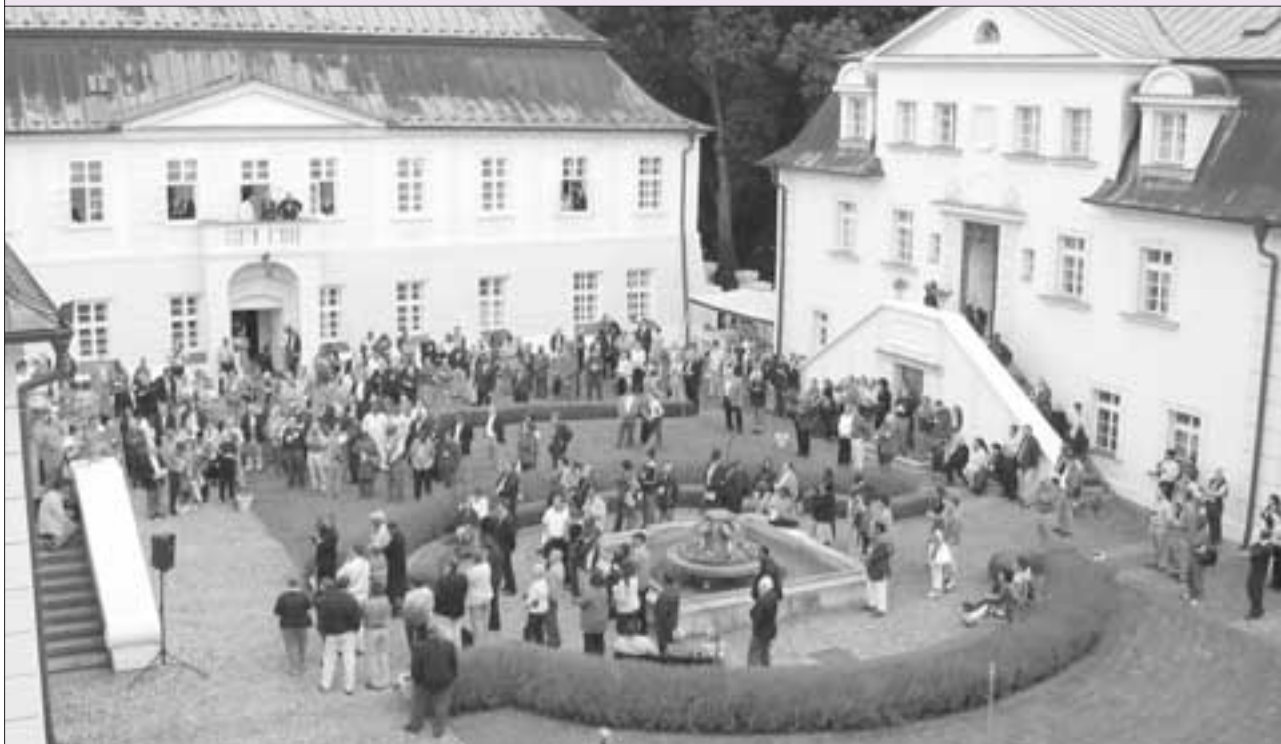
Over 400 people gather in the IBTS courtyard

This is the heart of what IBTS is about – serving our Baptist family, principally in Europe and the Middle East, by being a learning community providing high quality academic education in the context of prayer and worship; inviting to our campus countless others in sabbatical study, for conferences, to use our library or simply to enjoy our beautiful facilities.