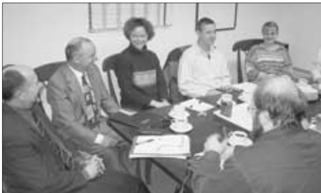
One of the first Environment Management & Protection Team meetings: 2003