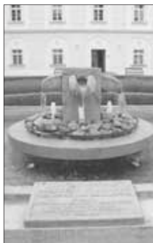
IBTS fountain (Prague)

Since that time IBTS has grown from an institution offering initial ministerial formation to a handful of European men, into a world institution providing accredited and validated degrees for women and men from first level to doctor of philosophy and with an expanding range of specialist post graduate programmes for continuing professional development. It is an amazing story with alumni serving in every continent and with a current student and academic team from over 30 countries and a community of 160 in our Prague family!