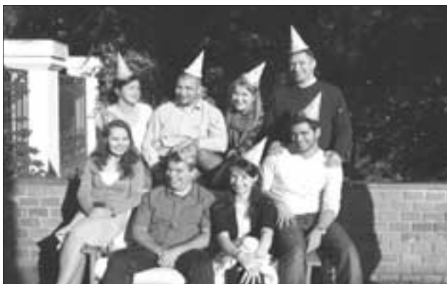
CAT students 2009-10