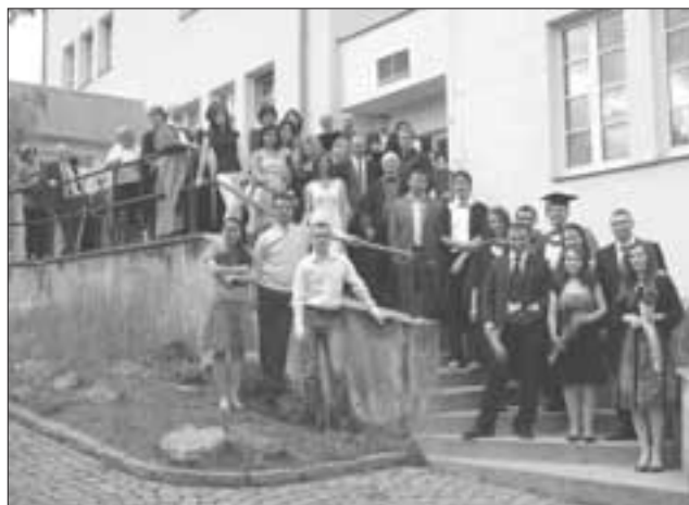
Graduating students, teachers, relatives and friends

On 28th May, a bright, sunny afternoon, thirteen students from the International Baptist Theological Seminary (IBTS) received their graduation certificates. One student received a Certificate in English Language,