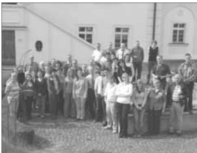
Student Week with a special contribution by the Northumbria Community