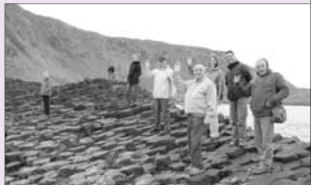
Group members at the Giant's Causeway