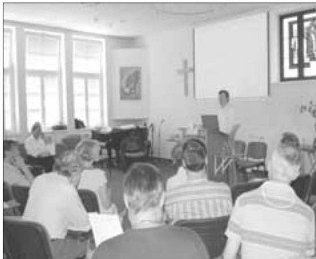
The European Christian Environmental Network Conference

Finally, we hosted the EBF Missions Conference 16 – 20 June which brought together the mission enablers of our Baptist Unions.