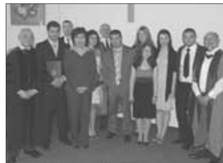
CAT students 2009-10

Friends and relatives of the graduating students were also present to share in the joy and happiness of this grand occasion. A festive buffet was prepared for everyone, where the celebration continued over savoury dishes and sweet desserts.