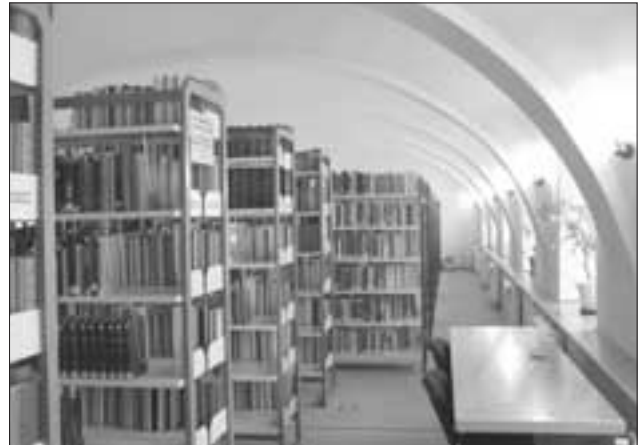
Quiet place for study with variety of books

Moreover, the increasing number of part-time students obligates us to supply them with resources which are accessible from every place in the world. Providing access to appropriate electronic resources at IBTS is accomplished in three ways: by subscribing to electronic databases, arranging trials of online databases and finding new and relevant open-access resources. During intensive teaching blocks, when many young researchers attend their lectures